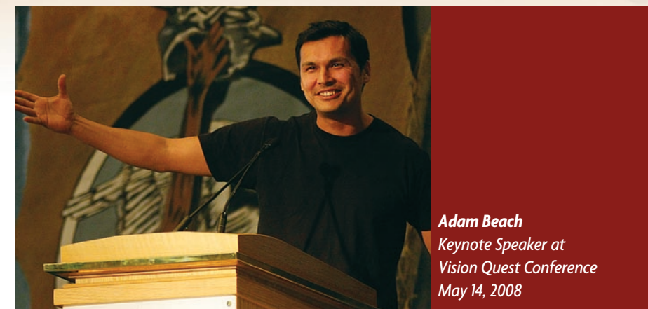
Adam Beach Keynote Speaker at Vision Quest Conference May 14, 2008

The 12th annual Vision Quest Conference took place May 13 to 15 at the Winnipeg Convention Centre. This year's event was the largest to date, with nearly 600 registered Delegates – including 177 youth – and a very busy tradeshow presenting 82 Exhibitors. Thank you to everyone for participating. It wouldn't have been a success without you!